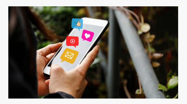
FOLLOW US ONLINE

Read the full article here: https://lnkd.in/d2cW_hYQ.