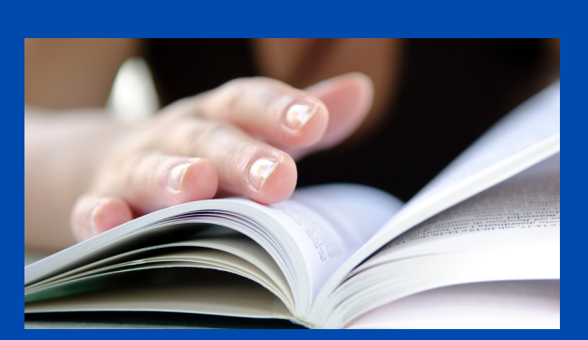
EVALUATION METHODOLOGY AND MATERIALS FOR THE ASSESSMENT AND COMMUNICATION OF THE E-SL COMMUNITY IMPACT

From January 2023 until October 2023 we implemented desk research to explore existing tools and methodologies used to measure the impact on the community. Based on the literature review, we prepared the first version of the evaluation methodology. Partners provided feedback on the first draft, and based on the feedback, the second draft was created. The guide should also help the universities to establish partnerships based on the idea of mutually beneficial relationships and the consideration of community needs.